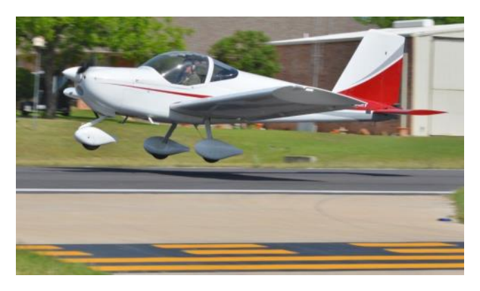
A friends nice looking RV-12 in this very nice photo. Pete Anderson is near Dallas, TX. OK, I'm biased!