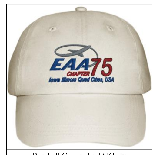
Baseball Cap in Light Khaki

Instagram: <a href="https://instagram.com/eaachapter75/">https://instagram.com/eaachapter75/</a>