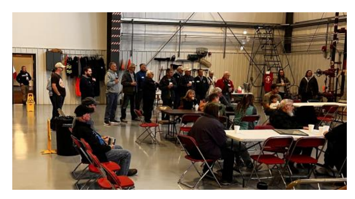
The attendees at the event.