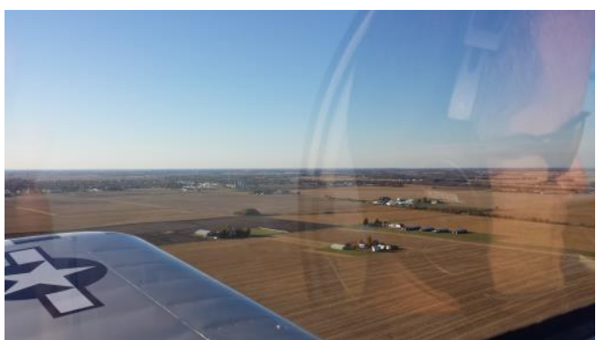
Thanks to everyone that submitted photos. Keep them COMING!! ANYTHING WORKS!!