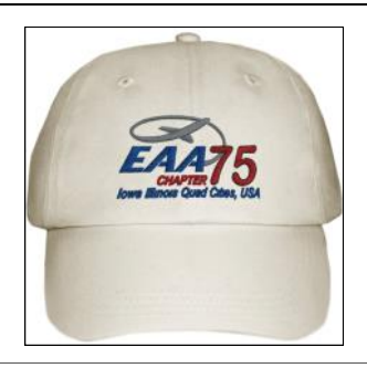
Baseball Cap in Light Khaki

Also available via CafePress are men's clothing items such as T-shirts, sweatshirts and jackets, women's clothing items, child's clothing items, accessories and holiday items with the logo. The logo is printed and not embroidered on all of the items from CafePress. Visit our store at www.cafepress.com/eaachapter75