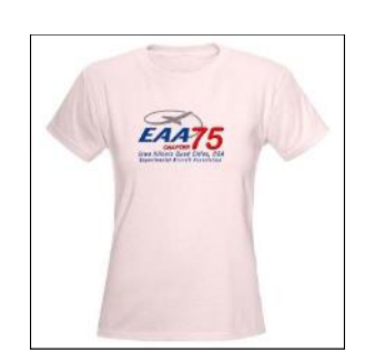
Men's Polo and Women's T-Shirt