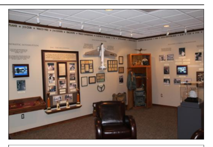
EAA Museum - In the Founder's Wing

When our fireside chat was over, we were again taken back to the museum for a behind the ropes tour, given by museum curator Alan Westby. We got to go into the archives and see everything from old aircraft blueprints, newspaper accounts from world war two, old