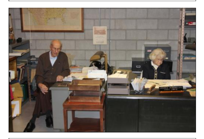
Reproduction of Paul's Original Basement Office