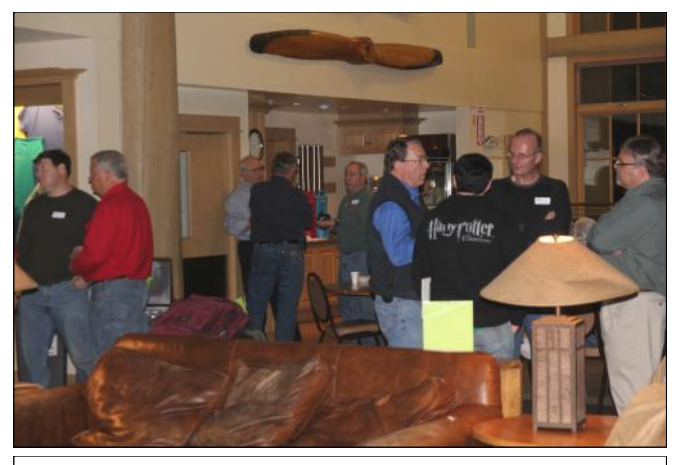
Inside the Air Academy Lodge

flight plan. The topics were beyond young eagles, Sporty's online course and first flight lesson and scholarships.