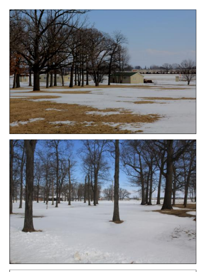
The Repair Barn and the Campground from my usual campsite looking toward the Theater in the Woods