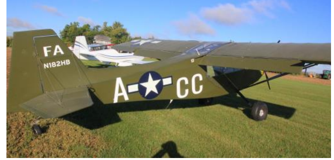
Jim Meade's 2022 RANS S-7S Courier (N182HB) from the right side.