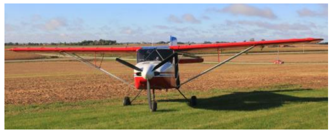
2009 Rans S-6ES Coyote II (N178B).