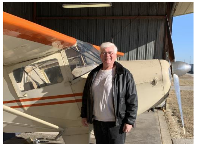
EAA Chapter 75,

It is now the month of November and the month for elections. We, in many towns and villages, will be electing town council members and school board members. All of these are important positions, and of course we will be electing new leaders for EAA Chapter 75.