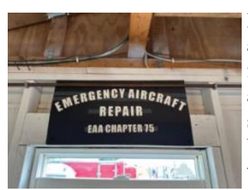
The EAR facility began informally in the 1960's with EAA Chapter 75.

Every year at AirVenture, a dedicated team of professionals stands by to assist their fellow enthusiasts in times of distress. We all hope and pray that we never need them, but if we do, they are a godsend. Started in the early