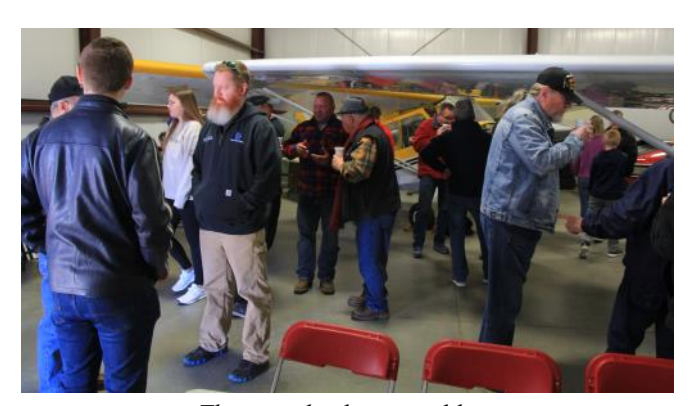
The crowd is having a blast.