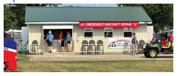
The Emergency Repair Shop at OSH is fairly small but can handle several projects at a time. They are known to do remote services all over the field.

Airplanes break or get broken (two concepts that aren't necessarily redundant). Stuff happens. Sometimes it's pilot error & sometimes it is fate continuing to hunt. Having a trip interrupted with an AOG (grounded aircraft) can be stressful and stress doesn't always lend itself to making the best of decisions. It can also be expensive without even taking into account if, heaven forbid, injuries to ourselves and/or our passengers are involved. As much as we do everything in our power to avoid incidences and interruptions, they happen, often right when we least expect.