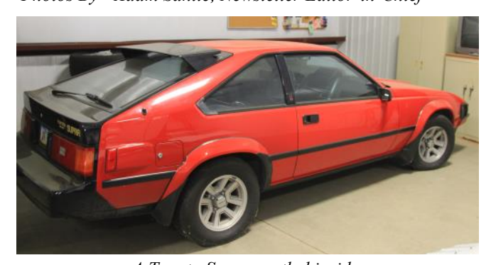
A Toyota Supra nestled inside.