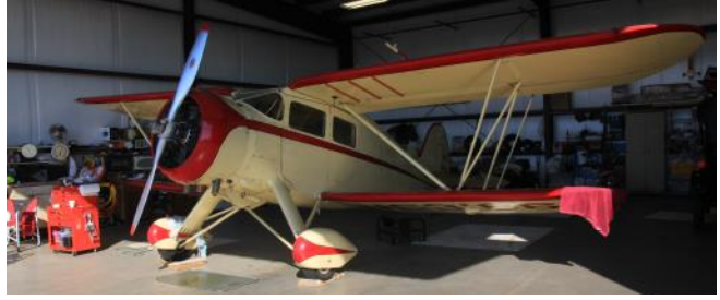
Jim Smith's 1942 Waco VKS-7F (N31663).