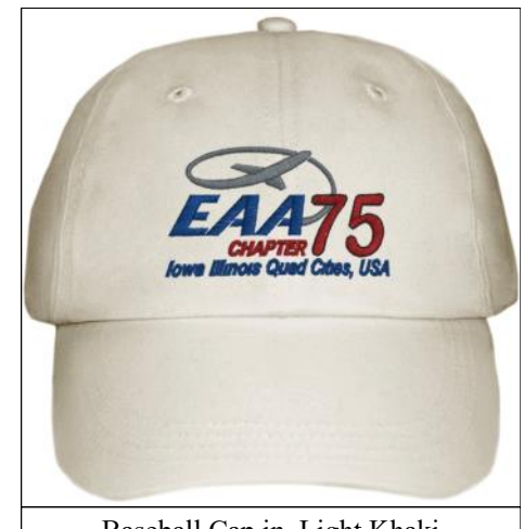
Baseball Cap in Light Khaki

Instagram: <a href="https://instagram.com/eaachapter75/">https://instagram.com/eaachapter75/</a>