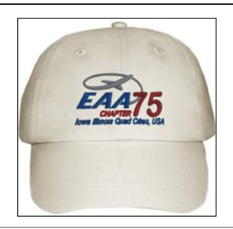
Baseball Cap in Light Khaki

Also available via CafePress are men's clothing items such as T-shirts, sweatshirts and jackets, women's clothing items, child's clothing items, accessories and holiday items with the logo. The logo is printed and not embroidered on all of the items from CafePress. Visit our store at www.cafepress.com/eaachapter75