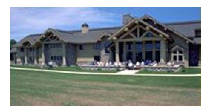
Air Academy Lodge

Give it some thought in your year end tax planning or estate planning.