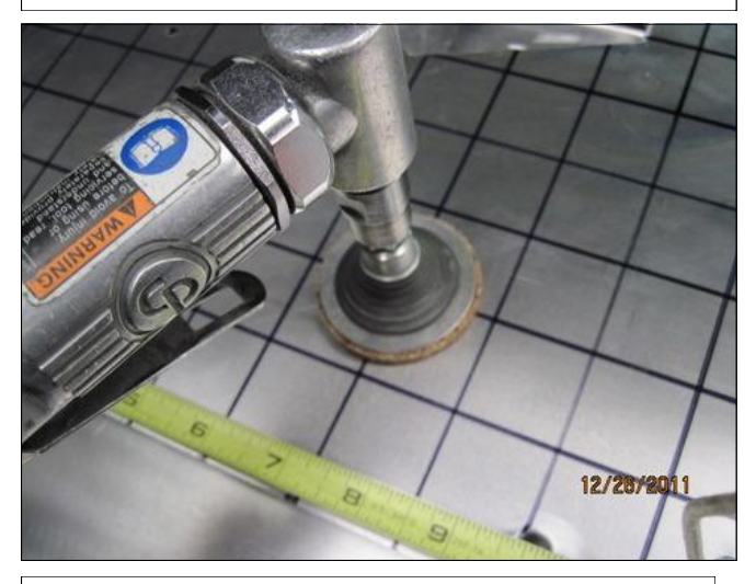
The lines you need will stay put.

The Scuff pad is 2"... I use an aluminum washer to help support the Scuff pad... It is dipped in the WD 40 and hitting the trigger. The excess fluid stays in the container.