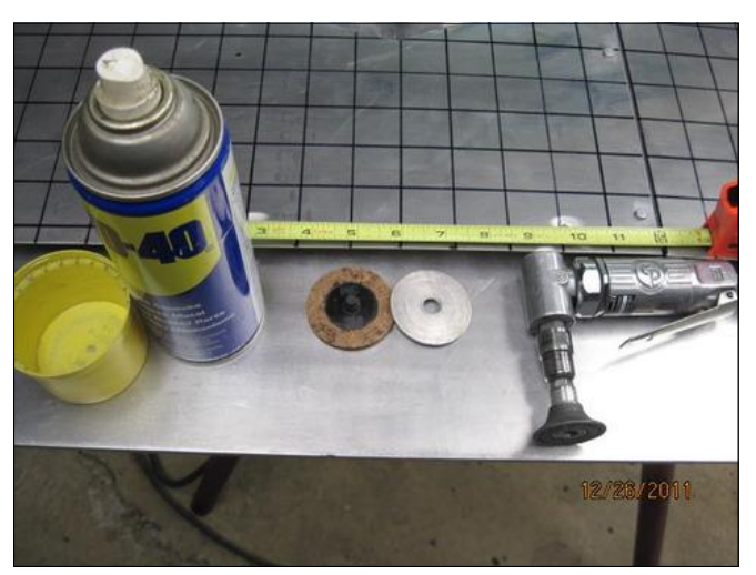
Pieces have the grid pattern (1-1/8th sq)

The Scuff pad is 2"... I use an aluminum washer to help support the Scuff pad... It is dipped in the WD 40 and hitting the trigger. The excess fluid stays in the container.