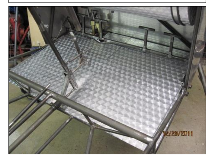
The finished product. Was careful to ensure the pattern was continuous between each of the floor pieces. An enjoyable project. And nice looking to boot!!