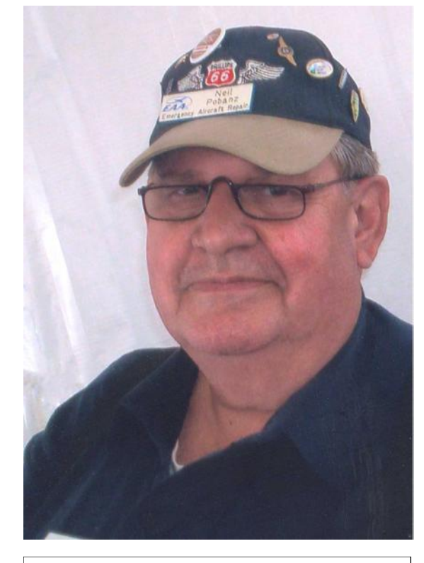
In Oshkosh at the Repair Barn

Was appointed by IDOT Division of Aeronautics, to serve on Illinois Terrorism Task Force's Aviation Subcommittee. Former president and presently secretary of Illinois Aviation Trades Association. Was