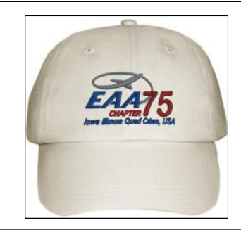
Baseball Cap in Light Khaki

Also available via CafePress are men's clothing items such as T-shirts, sweatshirts and jackets, women's clothing items, child's clothing items, accessories and holiday items with the logo. The logo is printed and not embroidered on all of the items from CafePress. Visit our store at <u>www.cafepress.com/eaachapter75</u>