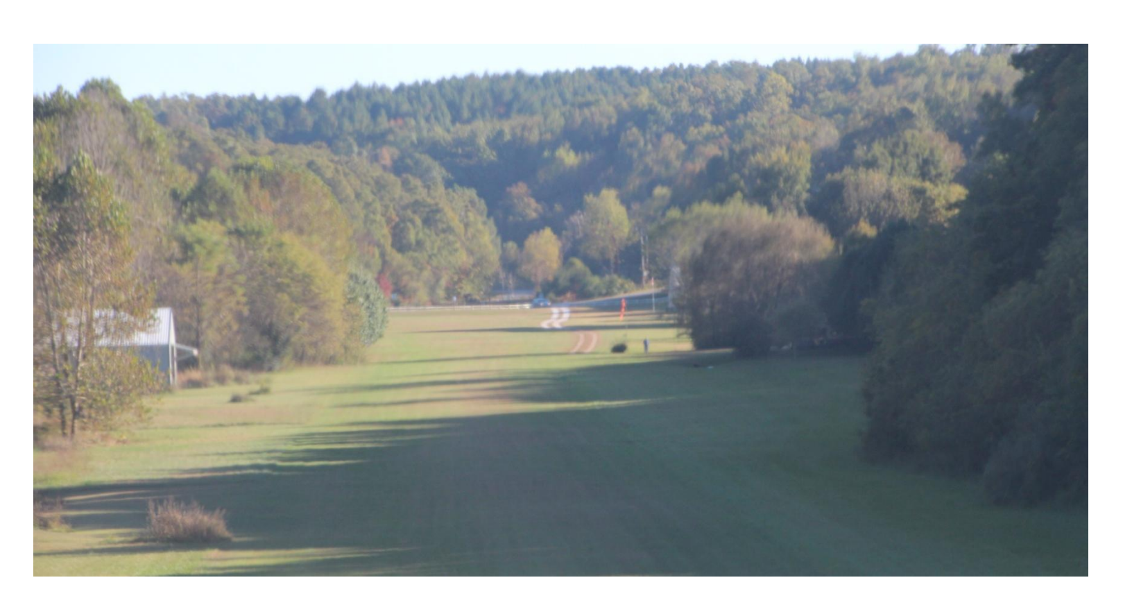
Coming home after a great day of flying