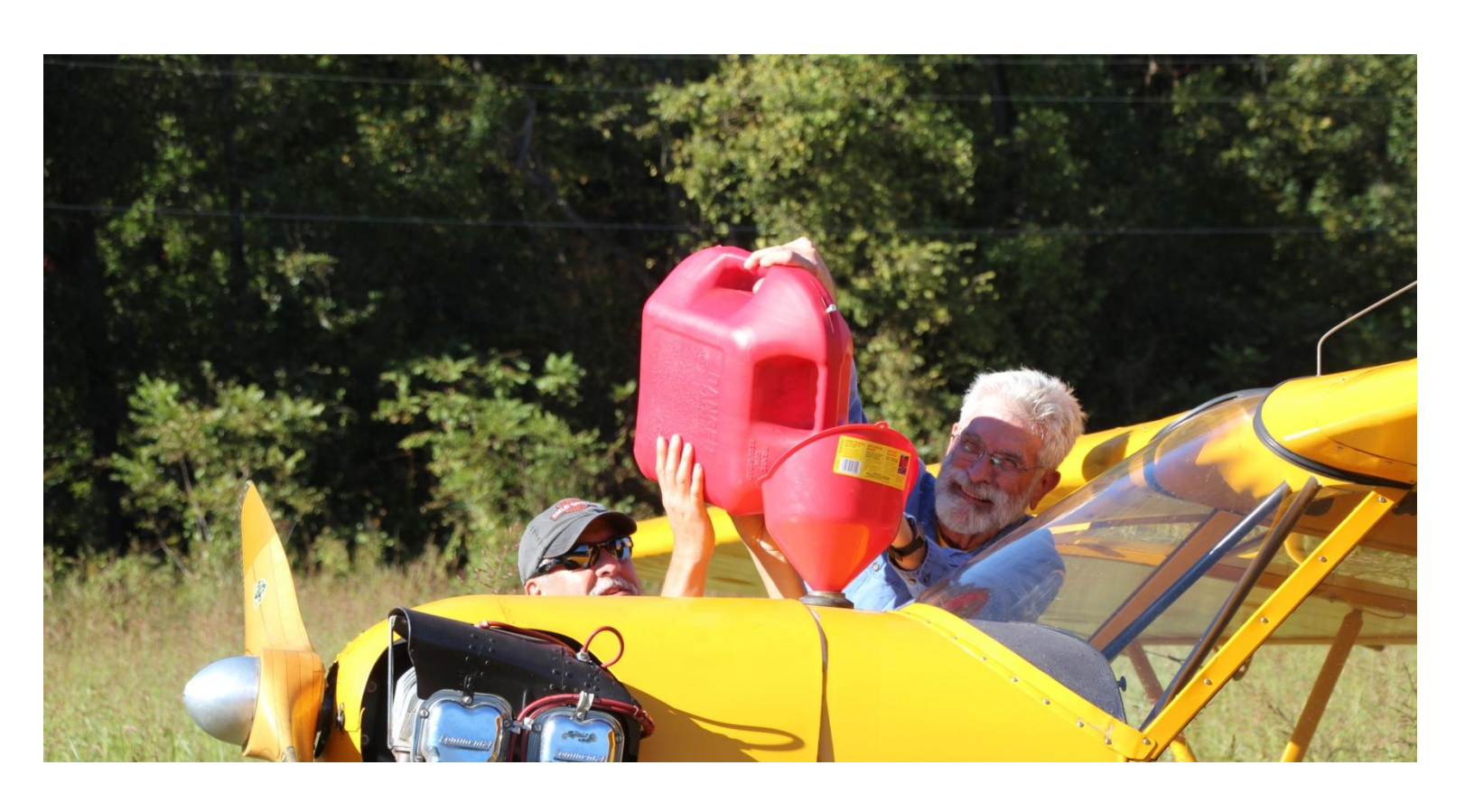
How many people does it take to refuel a Piper Cub?