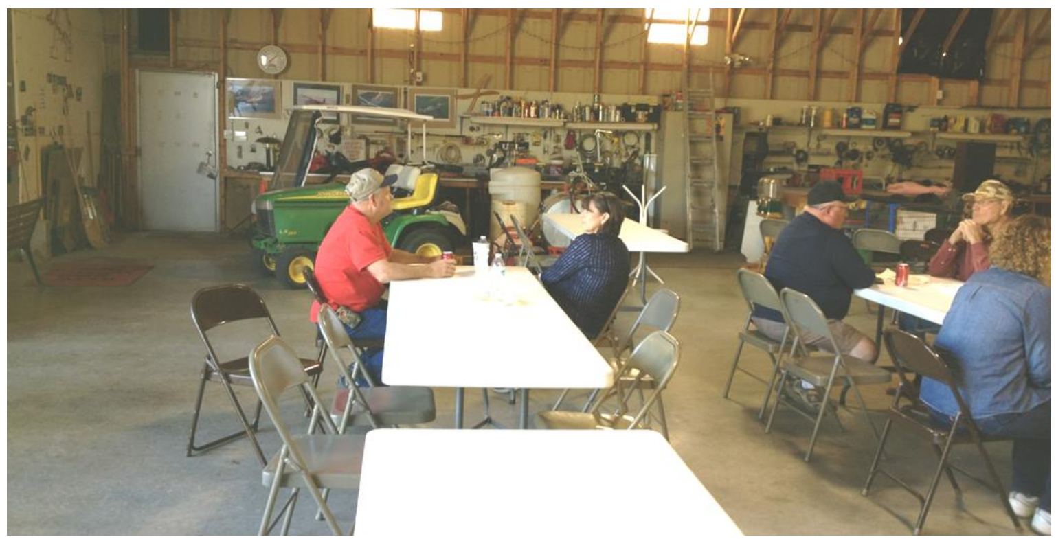
Fellow EAA Chapter 732 members enjoying each other's company at the Fly-In movie.