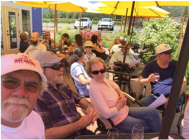
Did someone say wine? Great idea. A group of us gathered at Longsword winery in early June to enjoy a sunny afternoon and watch the paragliders launch off Woodrat Mountain and land right in front of us.