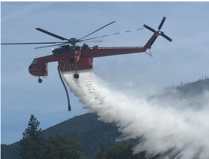
Erickson put on a real show with their Airplane water drop demo. An Airport Day first.