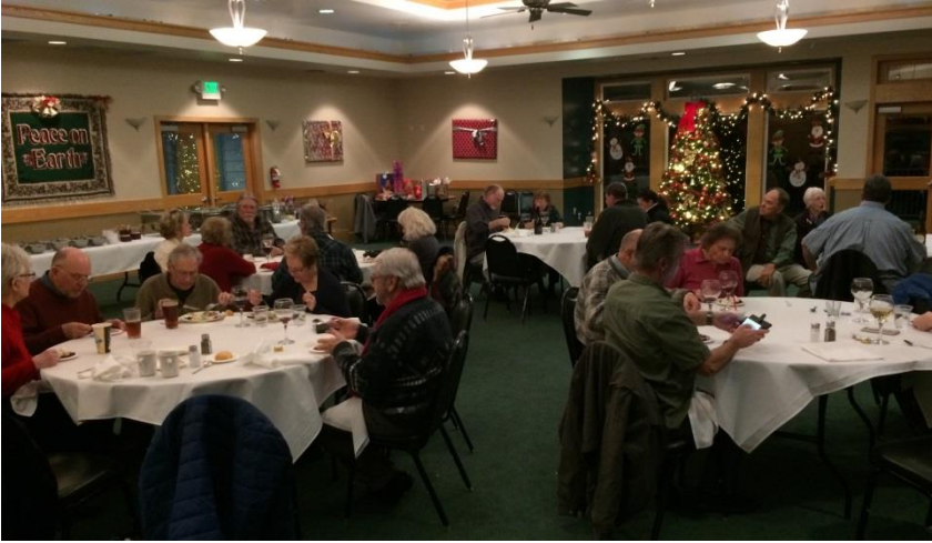
The dining room was all decked out to get us into the Christmas spirit.