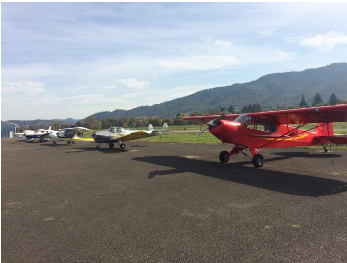
Myrtle Creek again in October. Most likely the last fly-out of the season.