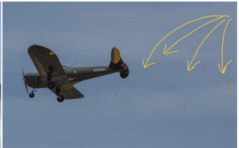
Another kind of drop. This was a demo in advance of the real chicken drop contest held in October. Of course, Joe's carpet bombing attack did not conform to contest rules. It definitely was for show only.