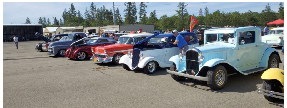
An impressive showing of local vintage and classic cars was also a part of the Airport Day displays.