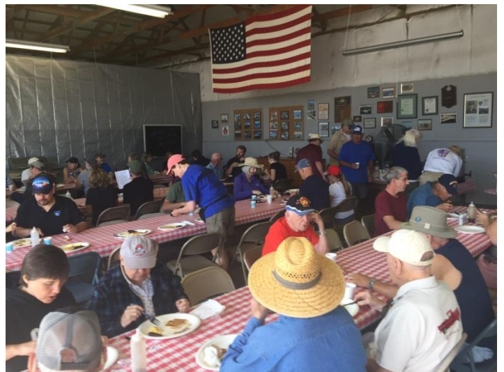
We served a couple hundred happy customers at our annual Airport Day breakfast in June. It's our one and only major fund raiser for the year. A real boost for the chapter treasury but a lot of work too. I don't think anyone wants to do this more than once a year, so we go all out and give it our very best shot. Seems to be working well.