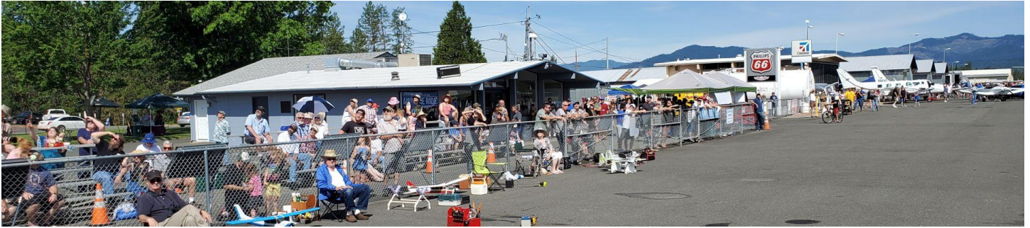
Part of the crowd that gathered for Airport Day, June 15. I think the rest were having breakfast.

A little trip down memory lane featuring three significant events that occurred at the airport this year. Not that chapter members weren't involved (aren't we always?), it's just that these events were not chapter sponsored.