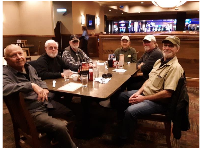
The usual subjects ready for lunch at 7 Feathers. We sure could use some new blood added to this group.