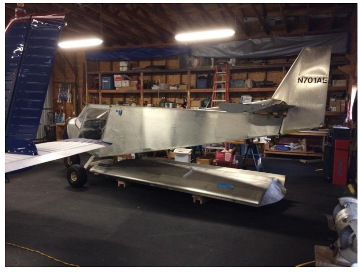
It's just visiting.

Note: I'd like to expand this section beyond the airport boundaries. But it seems my world is kinda small, so I don't hear much about other stuff going on with our chapter members. Maybe it's because I haven't asked 'till now. There's room in "Around the Chapter" for a lot more than I've been including. New grandkids? Birthdays? Travel plans? Visiting relatives? Most anything is fair game if you don't object to seeing it in print. Send it to me and I'll put it in.