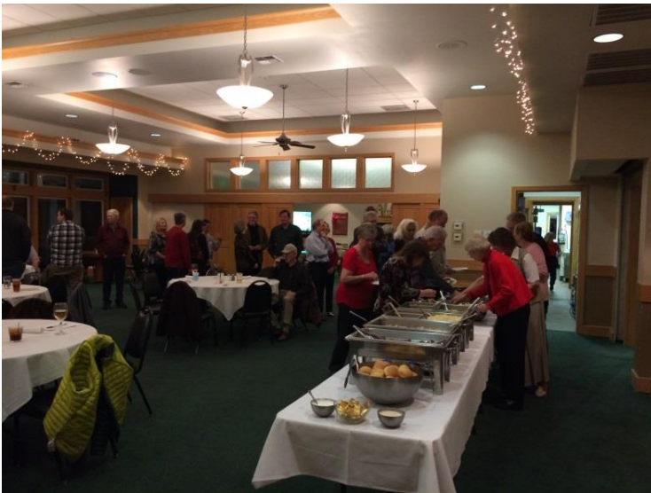
Chow time. They always lay out a great spread and we are the sole occupants for the evening. Two very good reasons why we keep coming back.