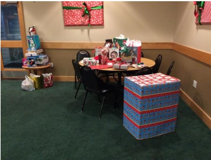
White elephant gifts on the right, toys for tots on the left. The banquet room is nicely decorated for Christmas and it's all ready for the party to start.