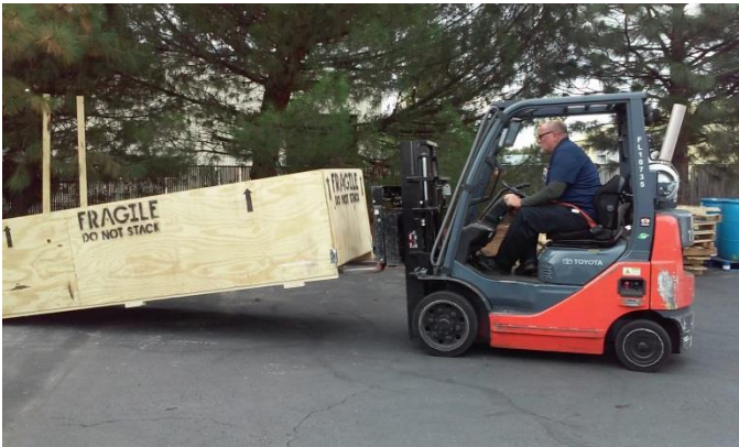
Arrival. The entire airframe kit in one box.