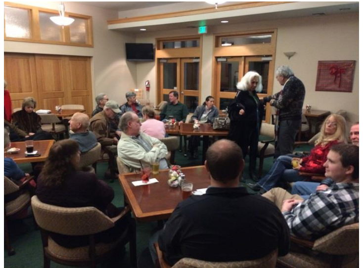
A bit of pre-party socializing with our favorite adult beverages. What could be better than this?