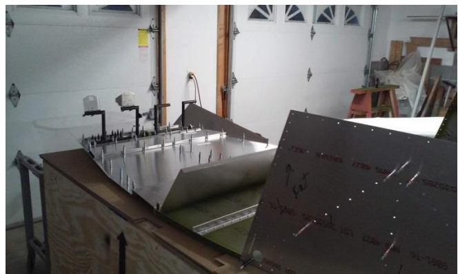
The beginnings of the fuselage structure.