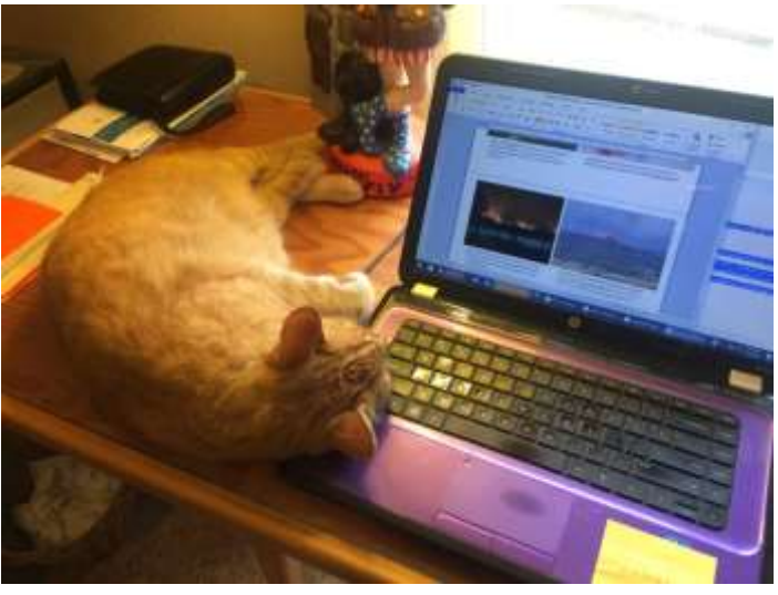
My editor-in-chief on the job. If the text in the newsletter occasionally looks a little skewed, now you know why.