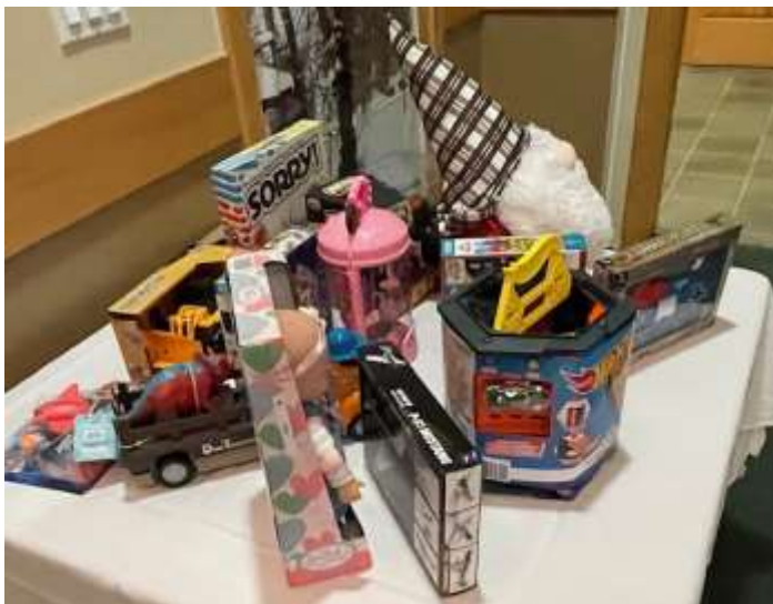
The attendees were very generous with their contributions to our Toys for Tots collection.