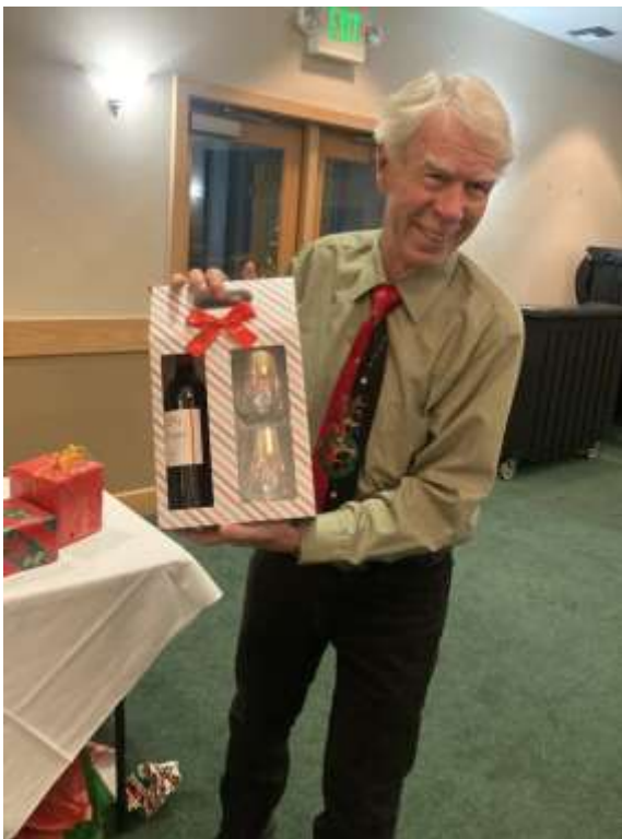
Now that's more like it. Dennis might need a bit of this (or something stronger) after presiding over a couple of chapter meetings.