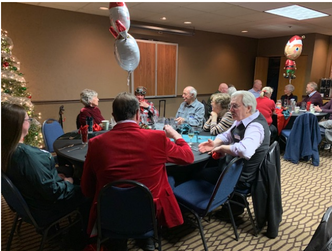
Hangar stories around the room.