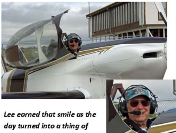
Lee earned that smile as the day turned into a thing of beauty. Great call!