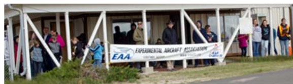
43 went home with sparkling smiles.