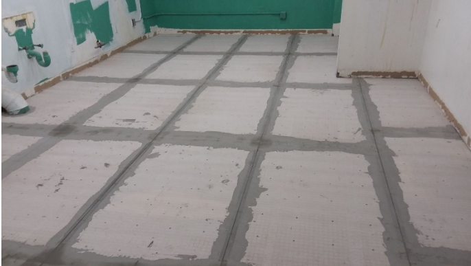
New Kitchen HardiBoard (underlayment) is installed.

The old, rickety, door and emergency stairway will be replaced with a new door and steel stairway.