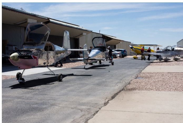
Meadowlake Secrets Revealed.