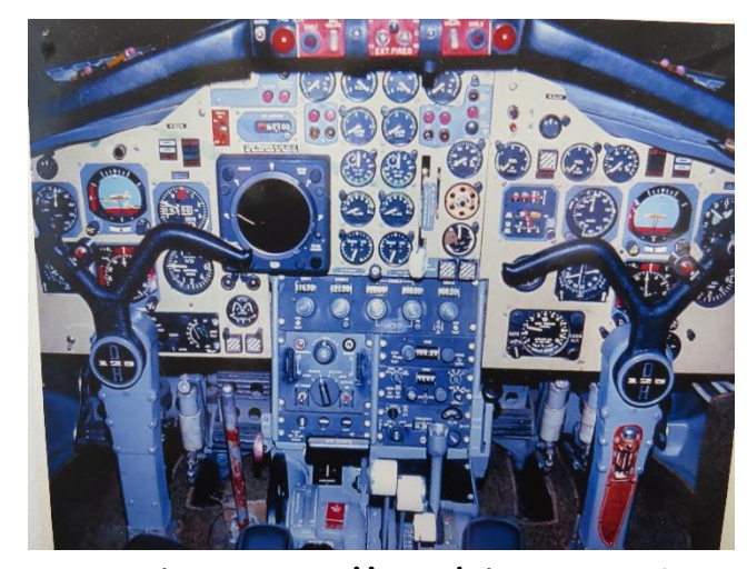
De Havilland DH-125

Remember: you can zoom in for more detail in pdf documents.