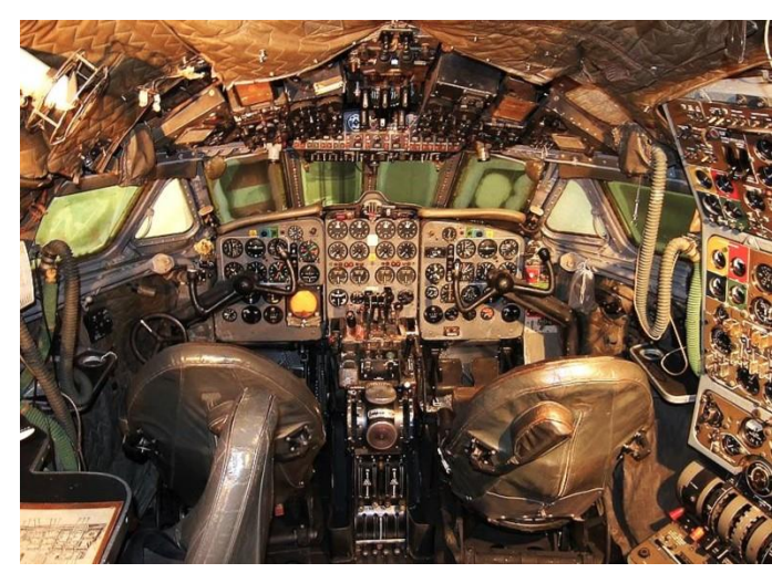
De Havilland DH-106 Comet

These cockpit photos are in themselves very interesting (I think). Cockpit ergonomics, as they say, was in its infancy. Many critical controls and instruments were scattered all over the place. The Comet cockpit was managed by 4 crew members. Two Pilots, a Flight Engineer, and a Navigator/Radio Operator.