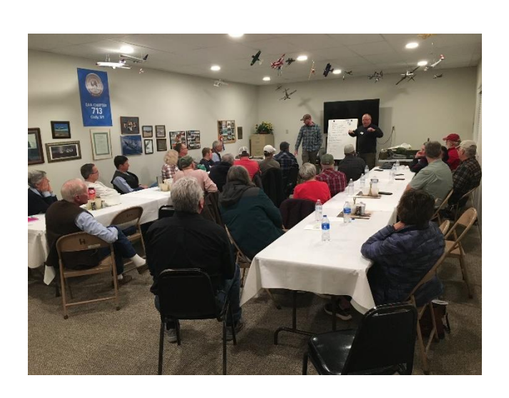
The presentation begins!

A couple different angles so nobody's left out but me.