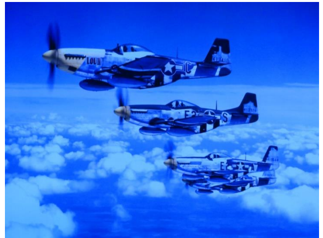
Photo of the actual aircraft in formation with other P-51s during WWII operations.

Amazing detail and accurate historical markings were a key feature of the P-51D.