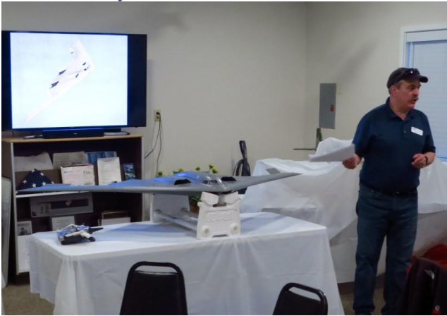
Northrop B-1 Bomber