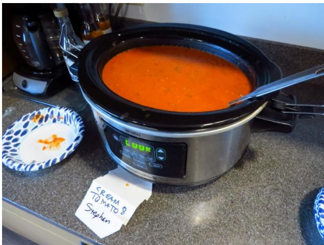
CREAM OF TOMATO Stephen