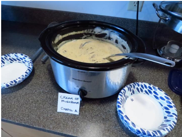
CREAM OF MUSHROOM CHERYL A.