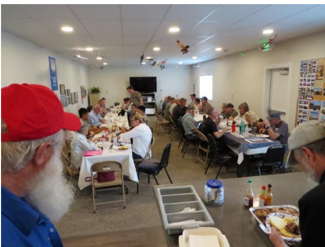
Finally, they're fed!