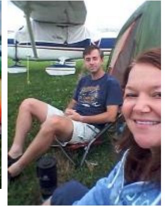
Under Wing Camping