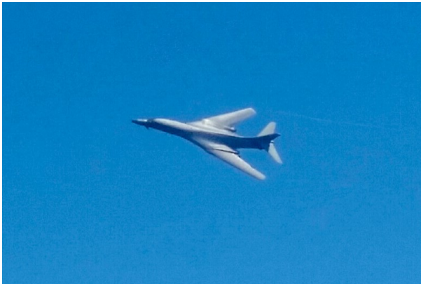
US Airforce B-1B Bomber making an entrance