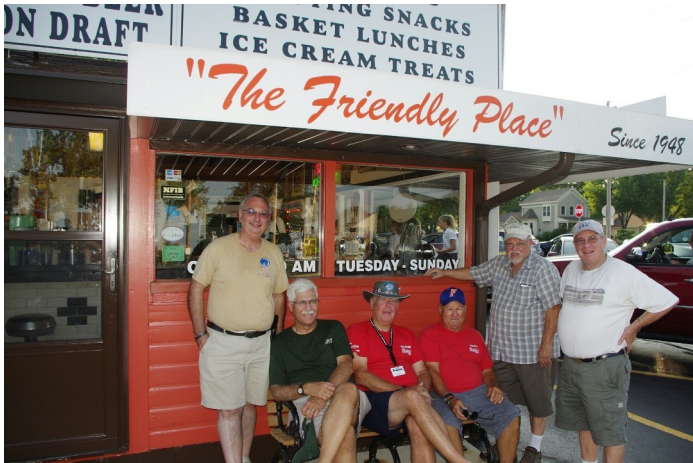
Some of the Gang gathering for Food, Refreshments and conversation