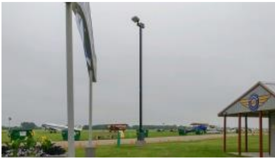
IFR a few days before AirVenture