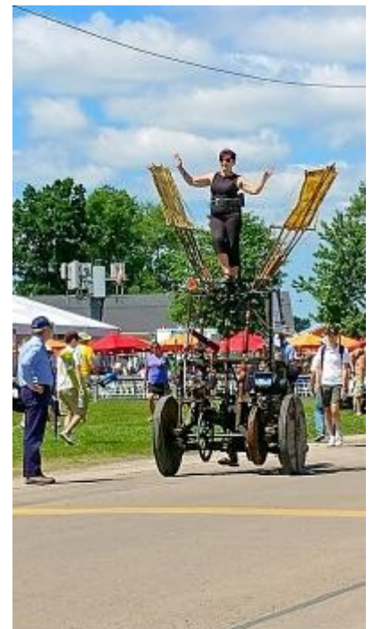
Always a crowd pleaser, the Ornithopter has wooden wheels and is powered by a single cylinder traction engine.