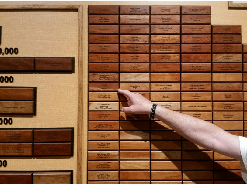
Joel Pointing out Chapter 690's Plaque on the Chapter Wall in Oshkosh