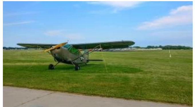
Early Arrival all alone