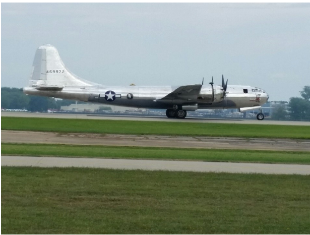
"DOC" the newly restored B-29