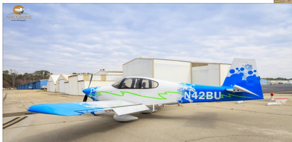
Beautifully painted RV-10 of Brian & Brandi Unrein