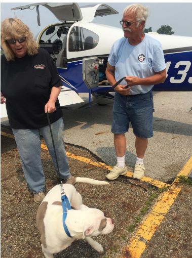
One happy dog and owner. Mission accomplished!