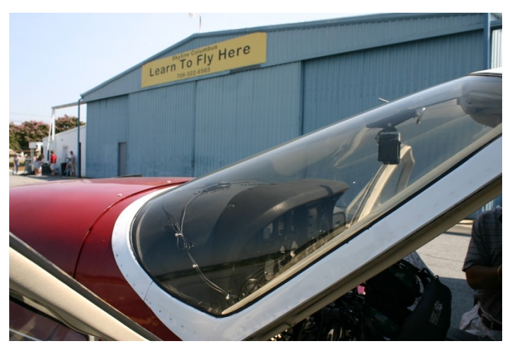
Nice view of our host Skyline Columbus