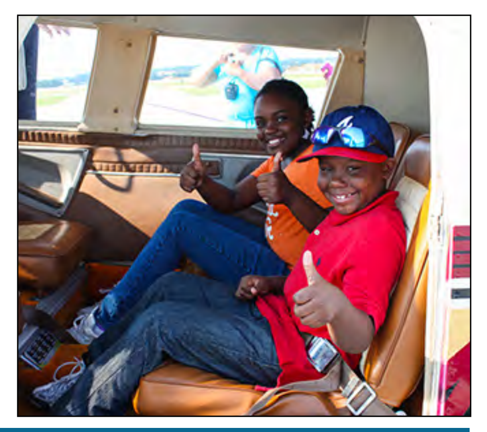
Hangar 13 News