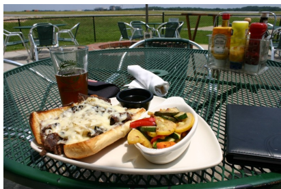
57th Sandwich before