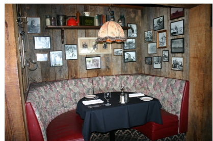
Loaded with memorabilia and artwork