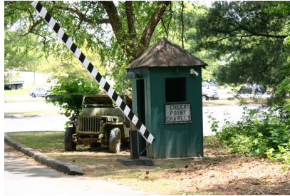
Past Checkpoint Charley