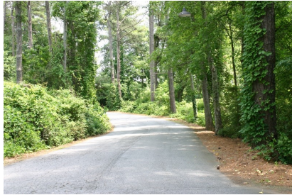
Through the trees and kudzu