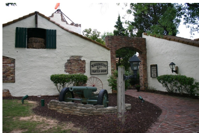
Yes, that is a cannon