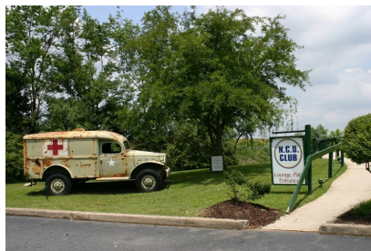
NCO Club entrance