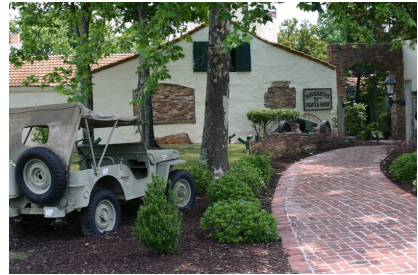
To the main entrance