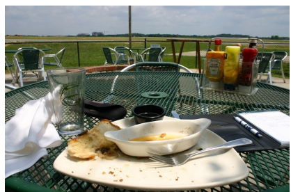
57th Sandwich after