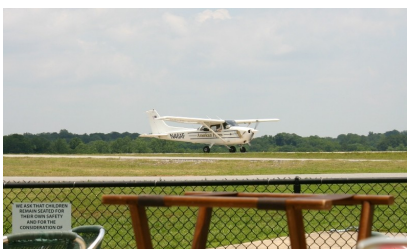
The view from my table