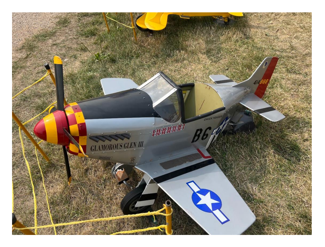
Nick buys a new homebuilt airplane kit at Oshkosh.