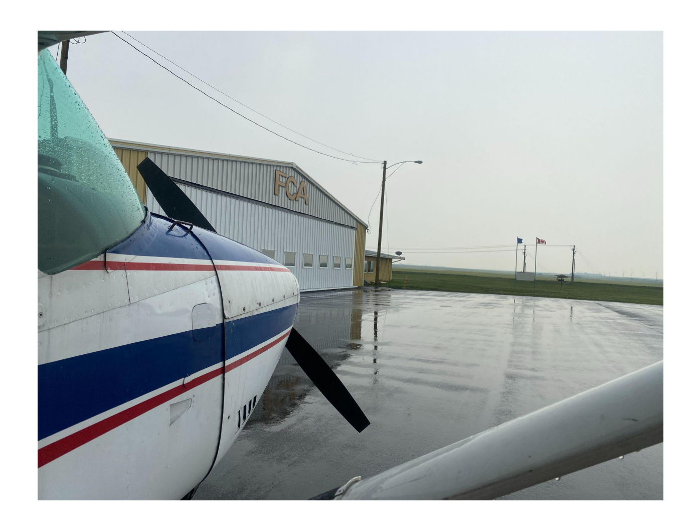
Rainy day in CA