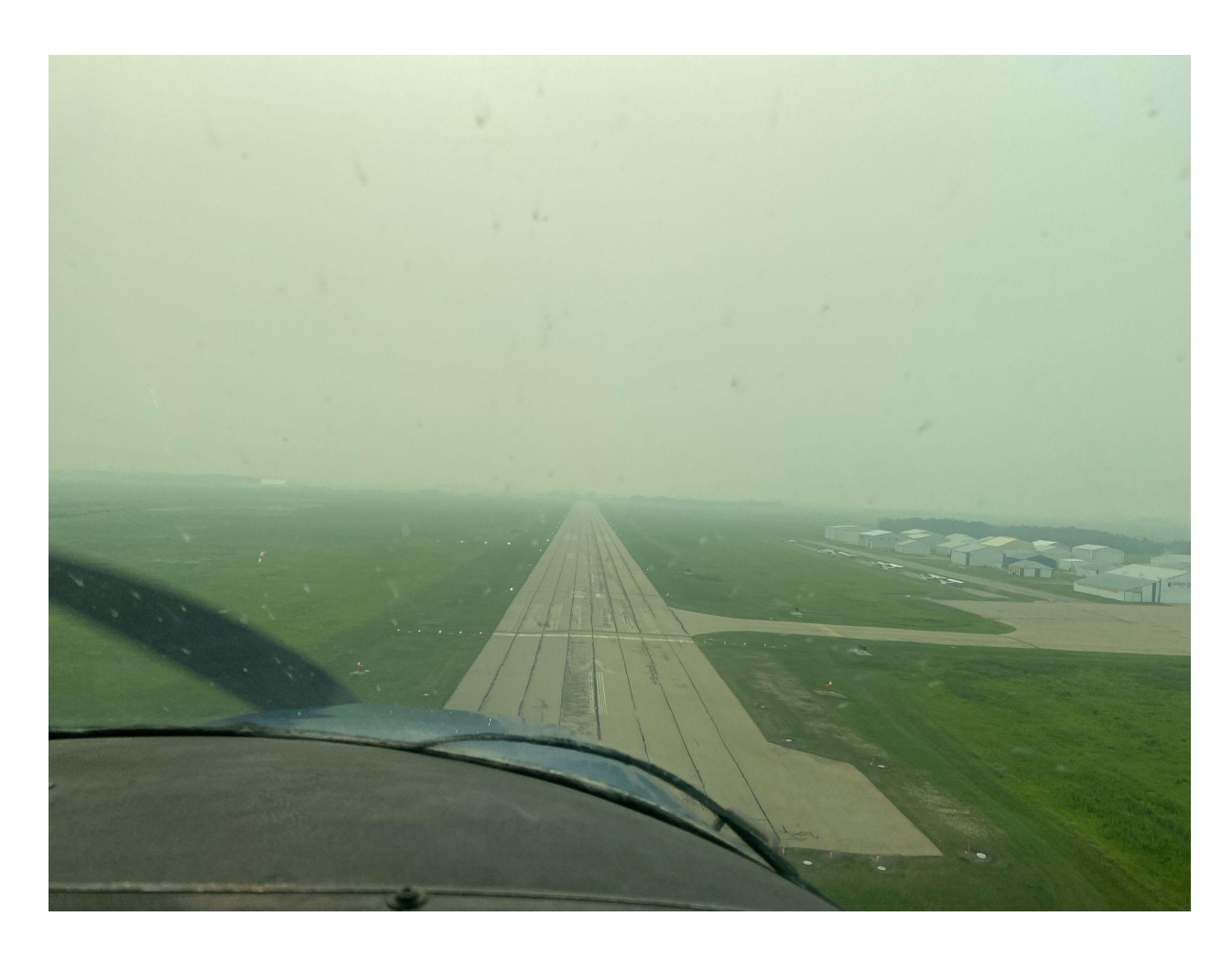
Low IFR fuel stop