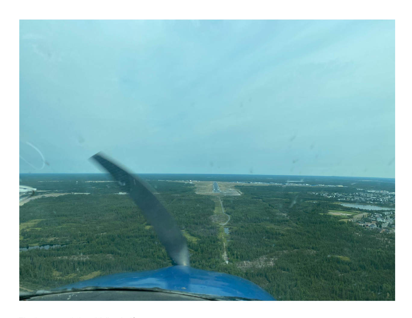
Final approach into Yellowknife