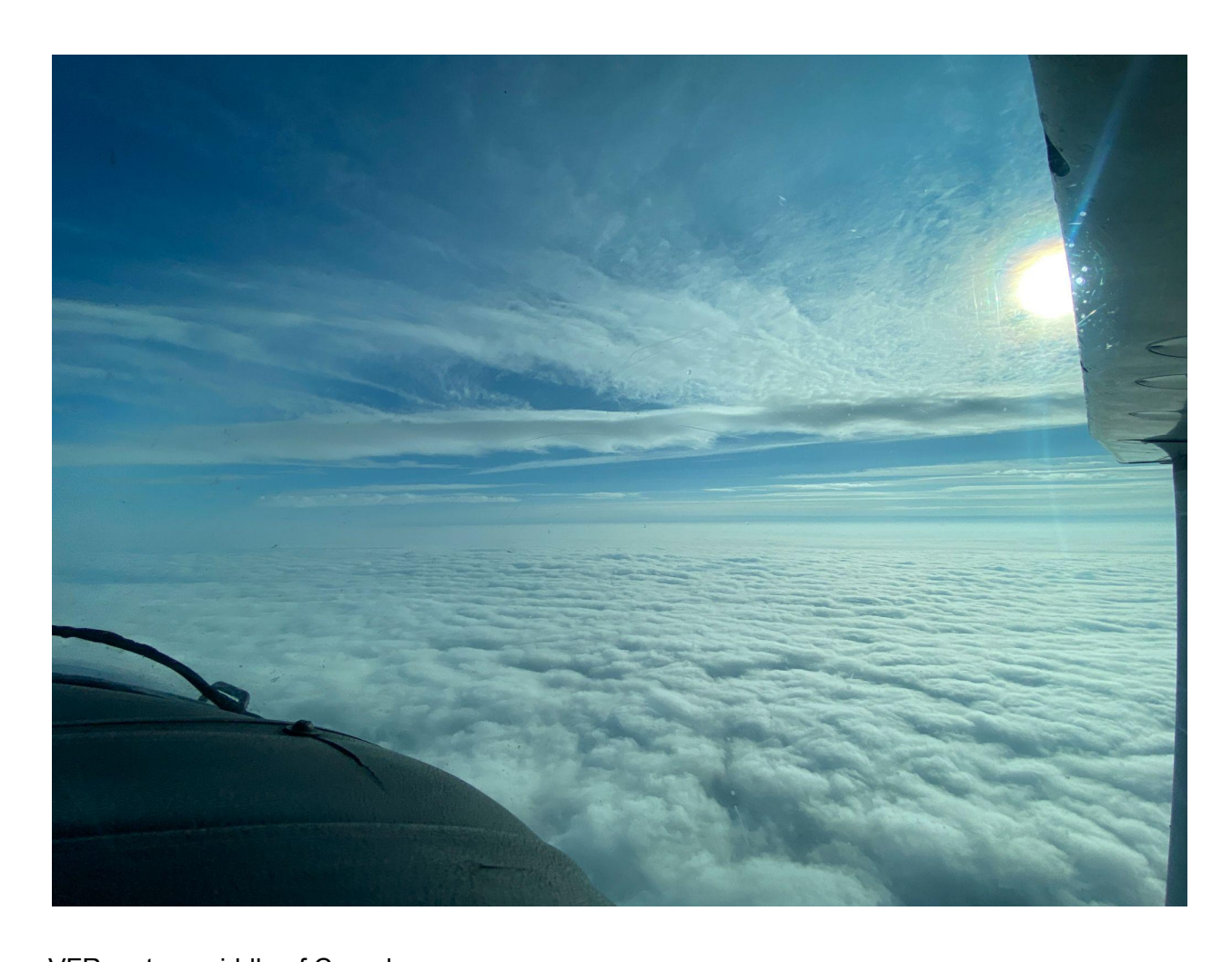
VFR on top, middle of Canada