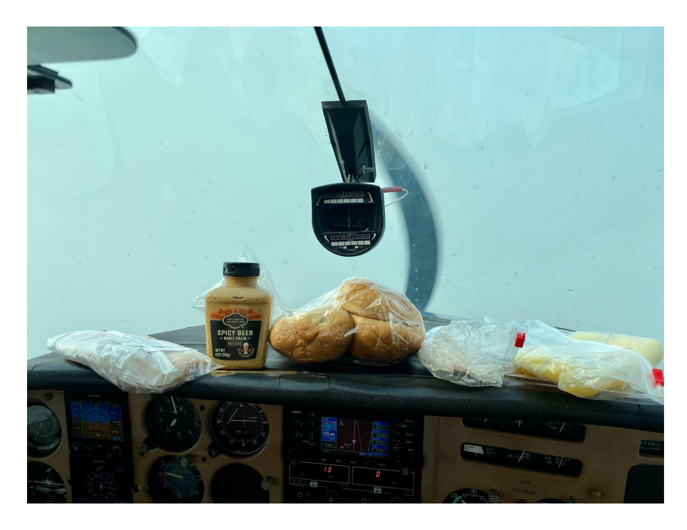
Lunch, IFR style