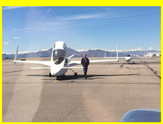
To members, friends and aspiring authors. Get published! DON'T FORGET!!! We need to get submissions from the members to include in future newsletters. I'm starting to run out of ideas and lies !! Let's hear from you!! Need "Plane of the Month", trip reports, technical tips, hangar tales, "beautiful planes" and aviation