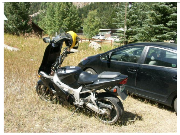
Who could possibly be this tall?