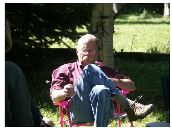
Obviously too much resin...