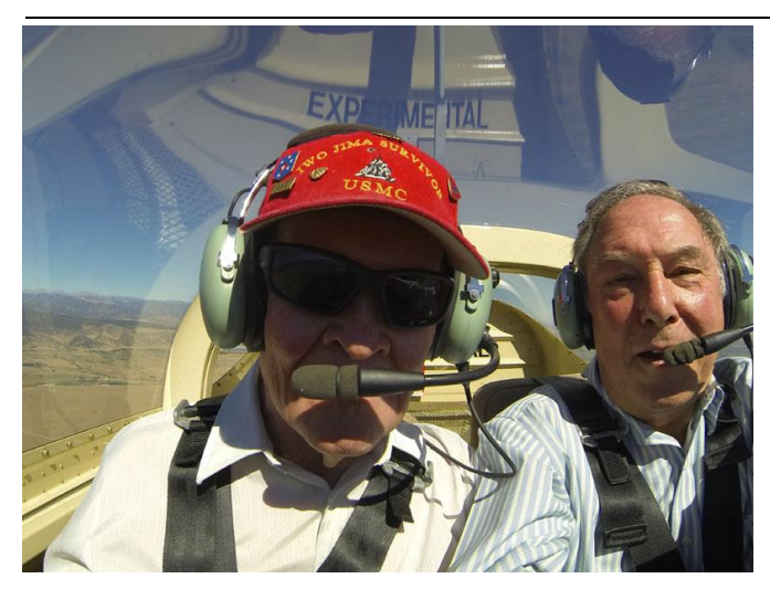
The two of us over Longmont.

Our Next Meeting will be held at 7pm, October 12, 2015, at the Colorado Classic Aircraft Building of Carol & Bob Leyner, located on the North side of the Longmont Airport