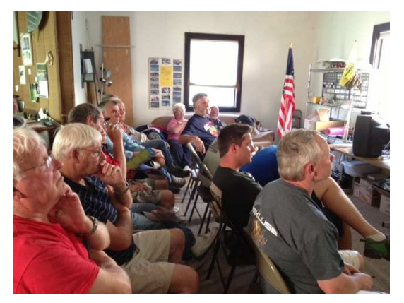
Got to wonder what was being said, but I bet it was about "volunteering for Chapter activities."