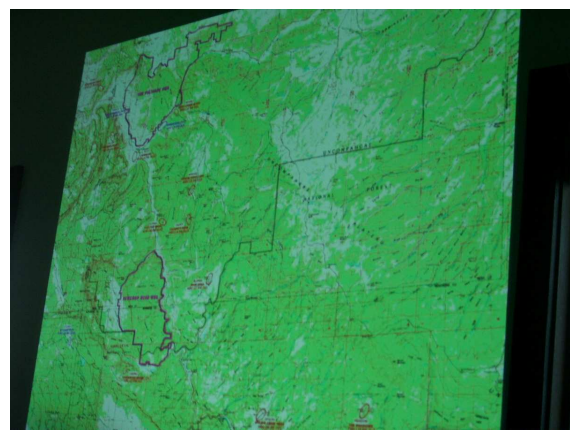
This group is for the promotion and protection of backcountry flying