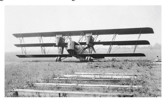
THE FRONT OF EACH ENGINE NACELLE WAS AN ARMORED GUNNER'S POSITION FOR THE INTENDED MISSION OF GROUND ATTACK.

The GA-1 production variant was capable of carrying eight .30-caliber machine guns and one 37-mm cannon.