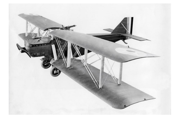
BOEING GA-2 GROUND ATTACK AIRCRAFT OF 1921 PLACED GUNS BETWEEN THE LANDING GEAR, FIRING FORWARD AND DOWN.

The Air Service, later Air Corps and Army Air Forces, had an evolving relationship with ground attack aviation up through World War II. While some Second World War bombers like the B-25 and A-26 employed bolt-on armor plating to protect the crew, this latter day shielding was less penalizing in aircraft performance than the sheathing on the GA-1 and GA-2. Speed and surprise favored ground attack in World War II.