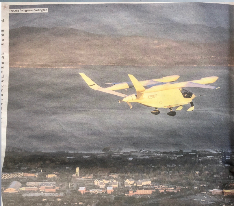
The Alia flying over Burlington

The prototypes parked in the hangar are the first two iterations of Beta's latest