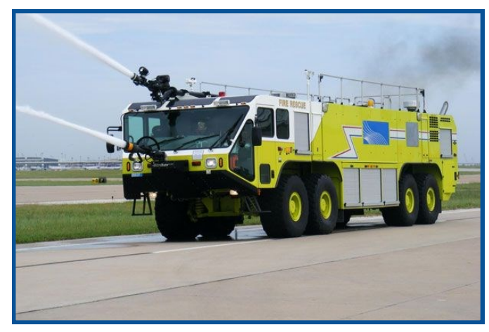
Joking aside... Airfield Operations is serious business.