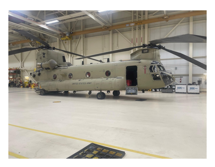
Thanks to the STC AGB for their tour during April's member program!