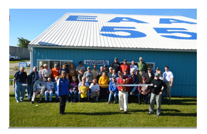
On June 14th, EAA Chapter 55 celebrated our 55th Anniversary with a Mason Area Chamber of Commerce ribbon cutting in front of our hangar.

<u>SNACK SALES</u>: We now have KLONDIKE BARS in a variety of flavors!!