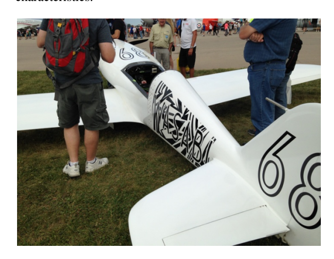
THE WASABI RACER

engine nacelle appear bulbous compared to the remaining lines of the fuselage. The landing gear are very short, much shorter than I expected to see, which is great for reducing drag, and there is no problem at all with propeller clearance because it has a very long propeller extension. The wing plan form has an interesting curved wingtip, which combined with the airfoil give exceptional lift and drag characteristics.