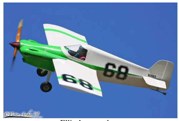
Elliot's new plane