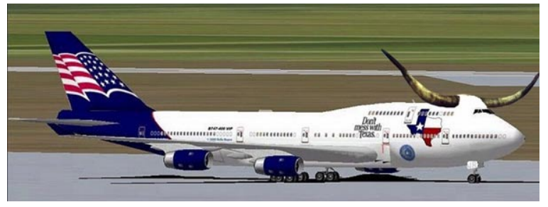
"The New Air Force One"