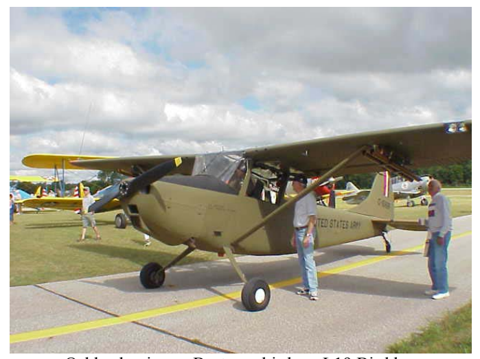
Oshkosh winner, Best war bird, an L19 Birddog