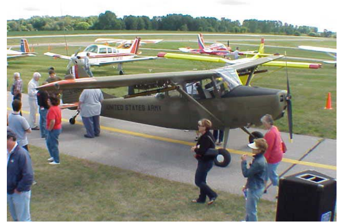
Some of the 49 registered pilots' planes