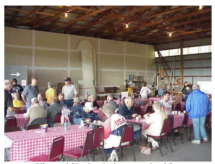
Pilots and friends enjoying a great breakfast