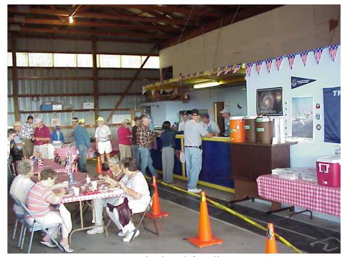
The breakfast line