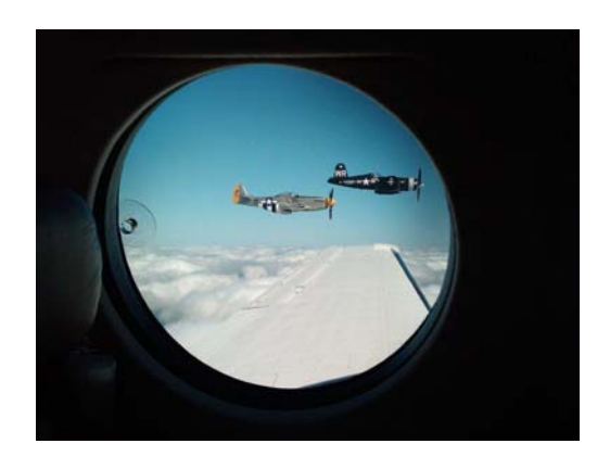
Mustang-Corsair

pancake breakfast in June and Mason Aviation Day in August. Additional information about the chapter and their fund raising events can be found at <a href="https://www.eaa55.org">www.eaa55.org</a>