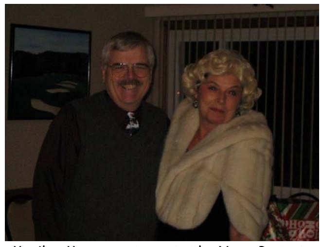
Marilyn Monroe returns to the Xmas Party to sing Happy BDay to the Prez