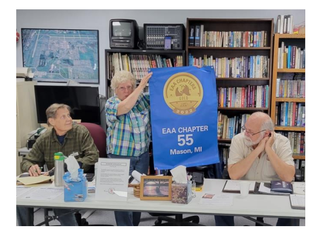
Chapter 55 made Gold again, thanks to the chapter as a whole!!!!!

Happy June everyone! Mother Nature has started the month out with great weather...hopefully it will be like this for Dawn Patrol on Sunday, June 11th . This is our first fund raiser of the year for the Chapter and we need all hands on deck to make the event happen smoothly. Please consider signing up for a time slot at the grills, helping in the kitchen, flight line security and/or plane parking. If you aren't sure of what you would like to help with - just add your name to the sign-up sheets available in the meeting room and we can assign a task to help out. We will be setting up the hangar for Dawn Patrol on Friday, June 9th starting at 10:30am. Help is also needed that day.