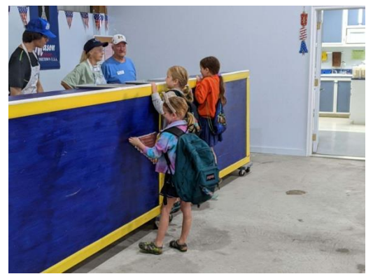
Kids keep our chapter growing. Our future of General Aviation starts with our youth dreaming about being up in the sky.

Chapter 55 was formed in 1959 and 2023 marks our 64th Anniversary