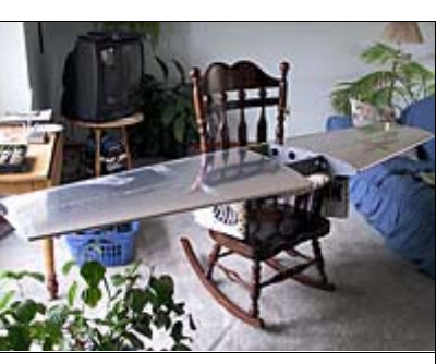
The Amazing Flying Rocking Chair, on display now at Casa Collins.

The longest HS project in history is finally finished and I'm generally pretty happy with the results. There's a few rivets in the skeleton a little too close to the edge and an occasional smiley or two, but it's time to to move on to the vertical stabilizer which is ready to be skinned. I'm considering some lighting options before closing it