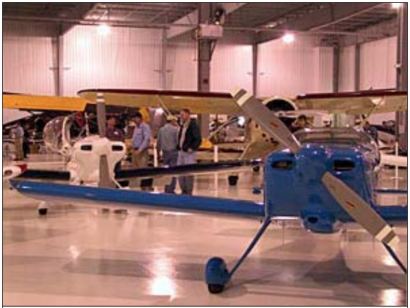
The old mixed with the new as the RV Forum was held in the Golden Wings Museum at Anoka-Blaine.

He also told me an interesting story about conflicts between Minnesota and Iowa (and other location) DARs and FAA personnel. Apparently a guy from Iowa built a plane in Minnesota to move to Iowa. The DAR who signed off on it granted X number of hours, the insurance company approved it. But when talking to the insurance carrier,