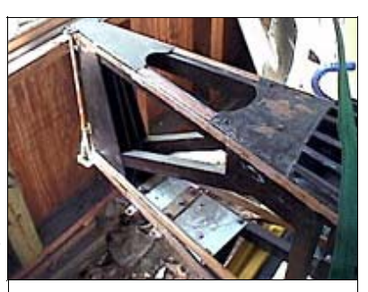
"Work to do on the tail," Kirk re-

Pietenpol Aircamper. Check out the progress at http:// www.mykitplane. com / Planes / photoGalleryList. С f m Menu=PhotoGallery. Scroll down to Kirk's name and find various photo albums there. The Pietenpol ports . once belonged to the