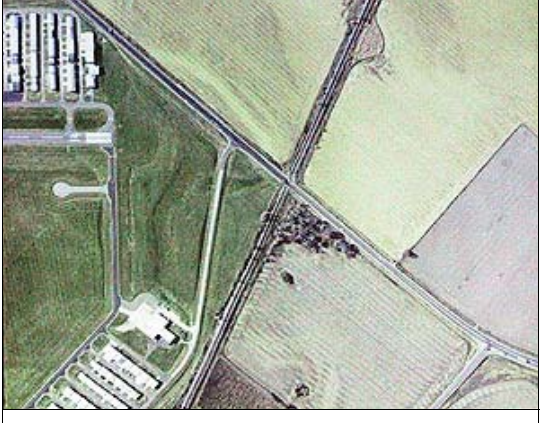
WHERE TO? You've just taken off on Rwy 32 and the en gine has quit, where do you go now?