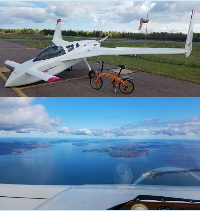
Enjoy the colors while you can! They'll be gone in a week or two.

And last weekend I flew up to Madeline Island to bike around a bit and take in the fall colors.