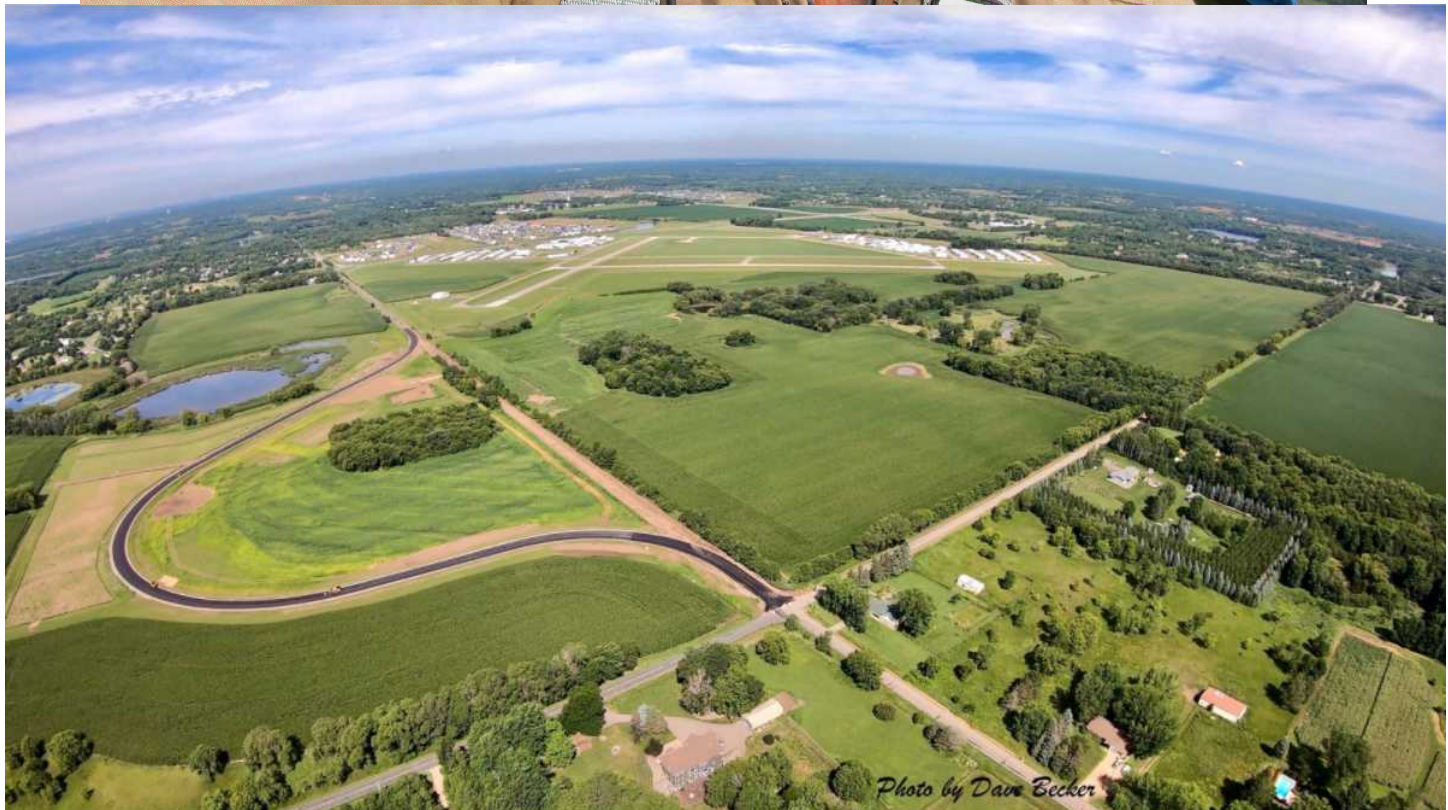
Page 7 of 8