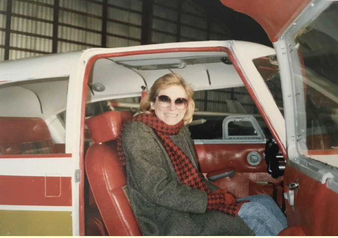
Here's a photo of me sitting in his plane at Lake Elmo, winter of 1988.

would be very happy to know his plane is serving such a good purpose for the country.