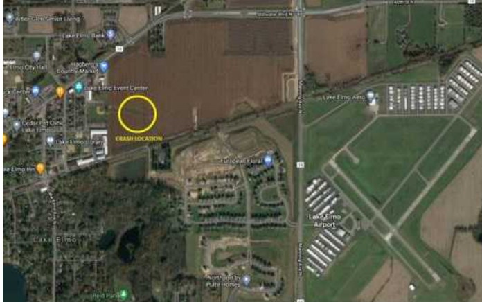
Two occupants were transported to a hospital for treatment of 'non-life threatening injuries'. This is likely the shortest distance the Lake Elmo fire

In less welcome news, on Friday Oct.2<sup>nd</sup> around 3pm, the Lake Elmo Fire Department was called to the scene of an off field landing in the cornfield east of Hagberg's Market, north of the railroad tracks, off the departure end of Rwy 32.