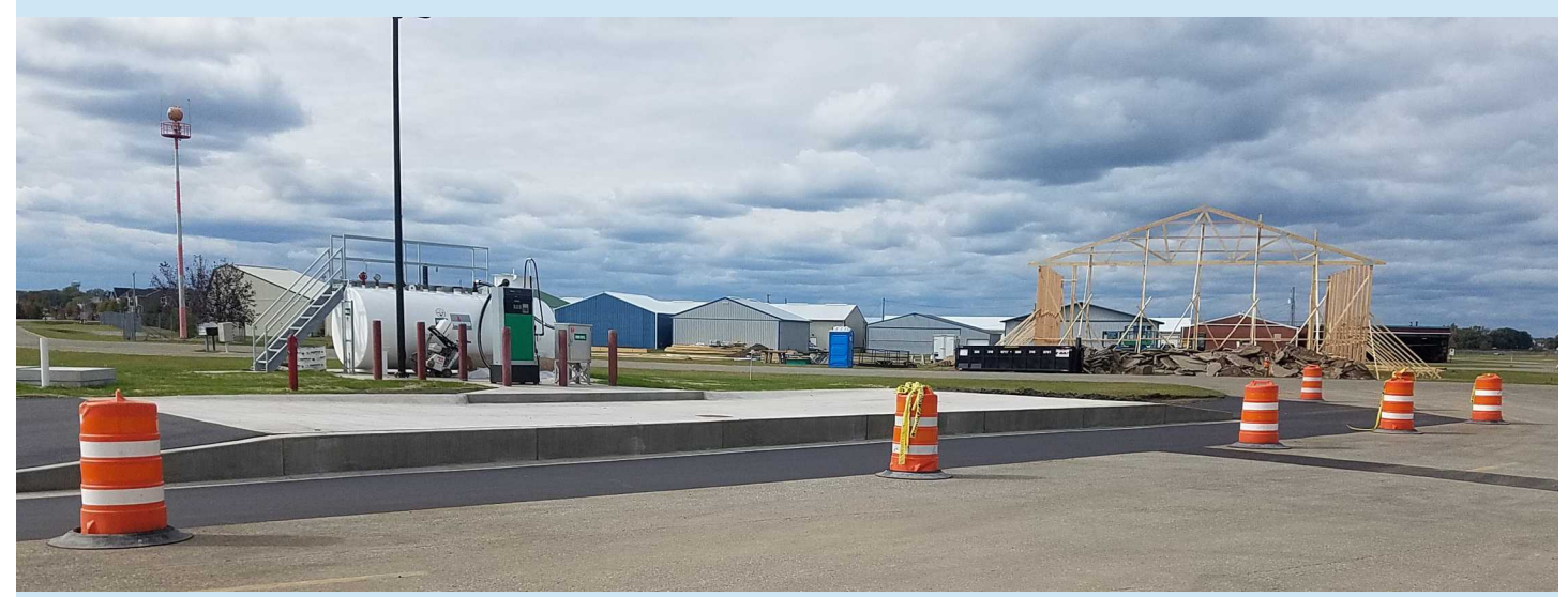
In the midst of this activity, Mike Wilson is turning management of the Lake Elmo airport over to Philip Tiedeman. Mike will manage Crystal and Holman airfields. Philip also manages Anoka County Airport.

A quick look around the Lake Elmo Airport reveals a lot of change at the moment. The airport improvement plan Phase 1 is complete, with the southern border (30<sup>th</sup> street) now looping south on the east end to provide an open exclusion zone for the soon to be relocated Rwy 32 approach end. I haven't seen any work begin on relocation of the runway yet, but MAC has installed a new fuel depot near the maintenance building, and construction has just begun on three new tenant hangars on the lane nearest the airport beacon.