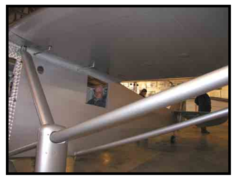
Jesse Black checks out the Spirit of Saint Louis replica.